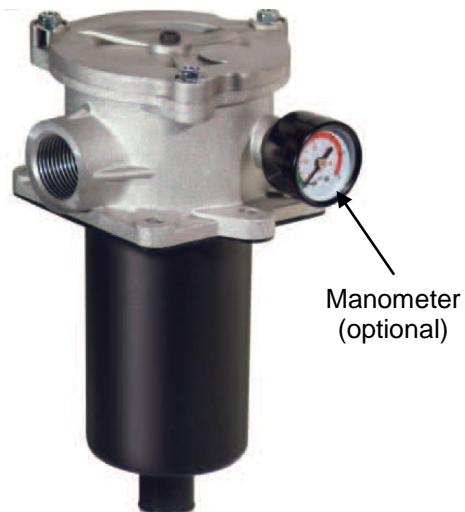
Tank mounting pattern